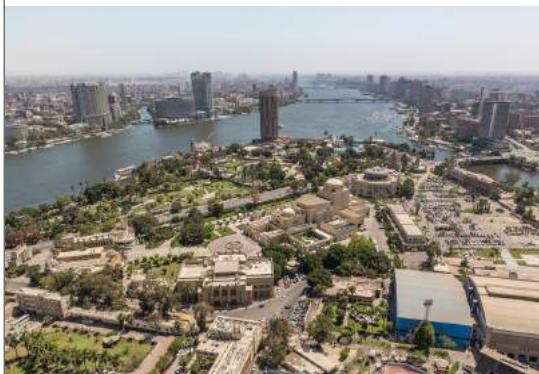
The River Nile flows through Egypt's capital city, Cairo.