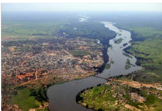
River Nile running through Juba, South Sudan.

The White Nile isn't really very white, and the Blue Nile isn't all that blue, either – more of a murky brown.