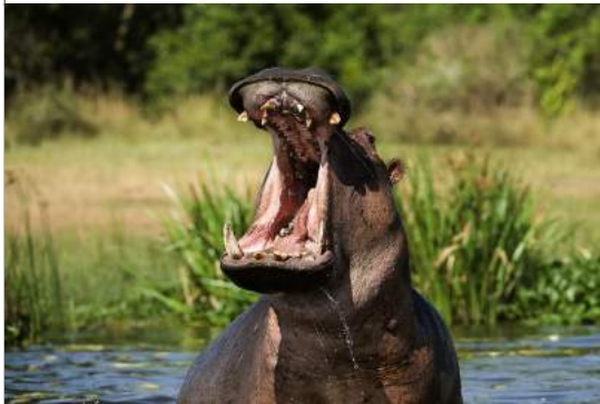
You'll find hippos on the banks of the Nile!