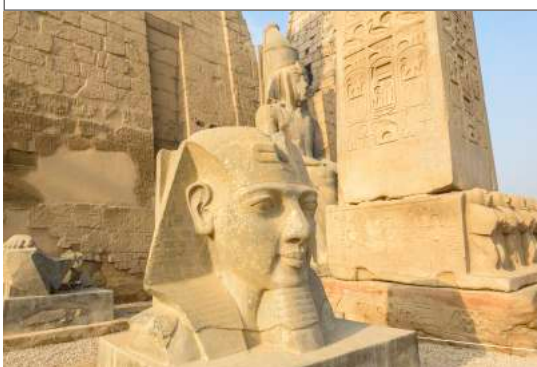
Ancient Luxor temple, on the River Nile.