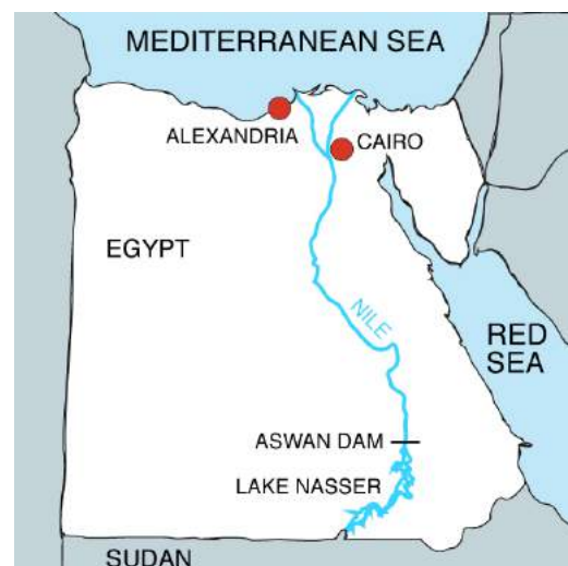
Map of Egypt and the River Nile

Where the river comes to its end, at the Nile Delta, the area is rich and green, as the satellite photograph shows.