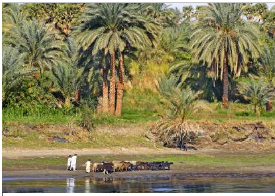
Egyptians have farmed along the Nile since ancient times.