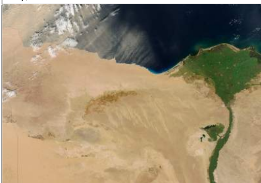
Satellite image of the Nile Delta.